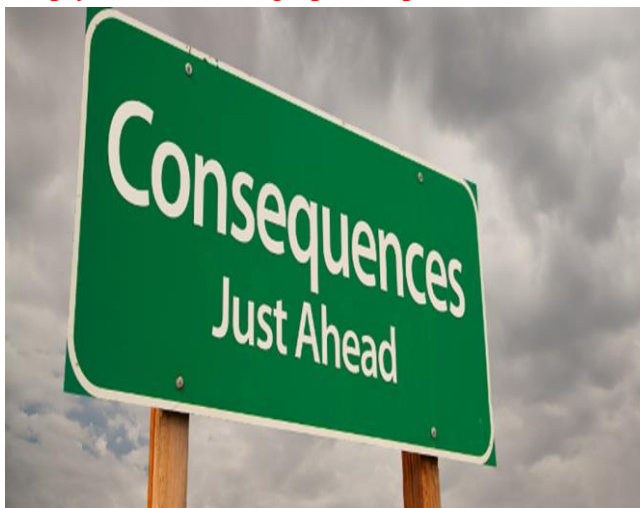
Figure 3. Photograph title